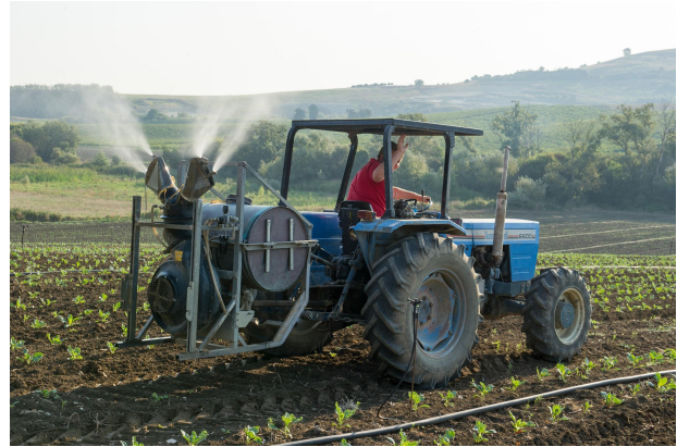
“Distribution of the 500”

Since its founding in the early 20th century, Fattoria di Vaira has always employed cutting edge agricultural techniques. Today, it is a 500 hectare expanse and sets a marker for Italy (and Europe beyond) on operating a closed-cycle biodynamic farm. Fattoria di Vaira makes 3 wines in the Terrae line: bianco, rosato, & rosso. Being healthy and genuine, they are intended to be enjoyed on a daily basis.